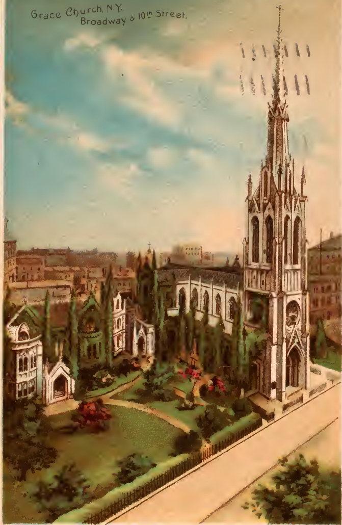
Grace Church, N.Y. Broadway & 10 th Street.